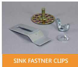
SINK FASTNER CLIPS